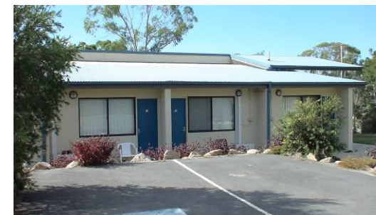
Motel Units have an en suite, fridge, tv, air con.