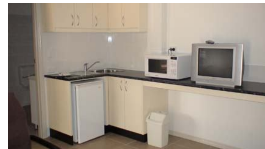
Family suites are self contained with lounge, 1 bedroom, , kitchenette, en suite, air con.