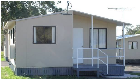
Chalets are self contained with two bedrooms.