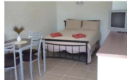
Double suites have a fridge, tv, microwave, air con.