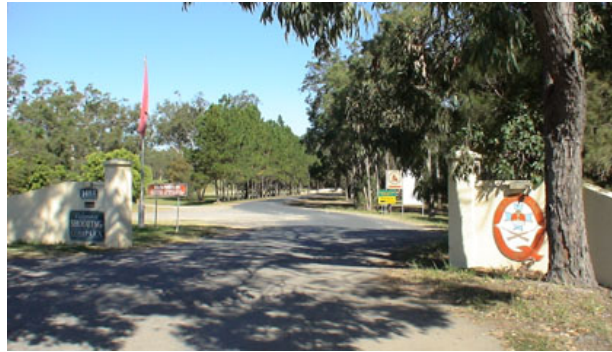
Main Entrance at Belmont Range