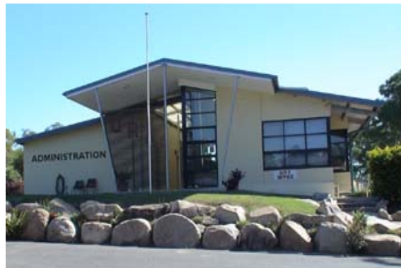
QRA office at Belmont Range