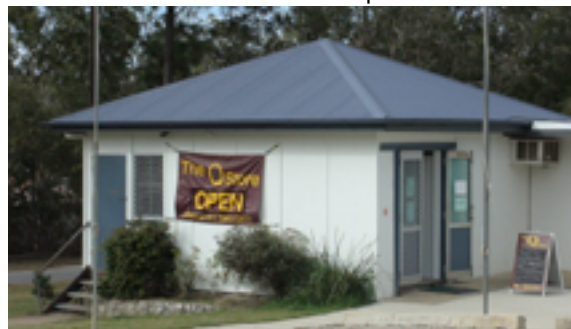
The Q Store at Belmont Range

Thu-Sat 10 – 5 pm Phone: 07 3843 5377 Fax: 07 3395 2777 E-mail: qstore@qldrifle.com www.qldrifle.com