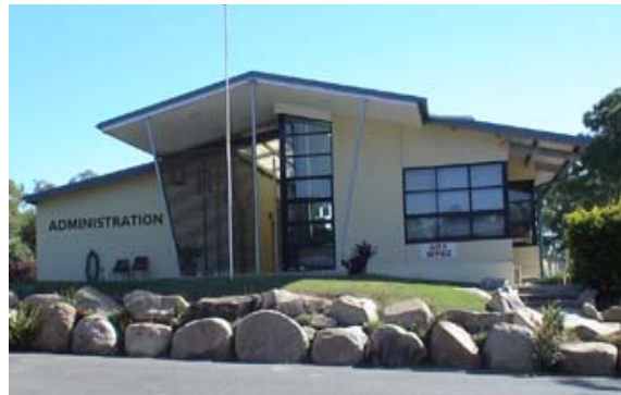
QRA office Mon-Fri 8.30 – 4.30 pm