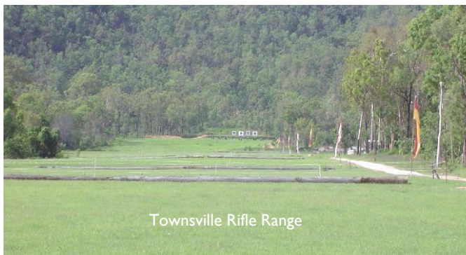
Townsville Rifle Range